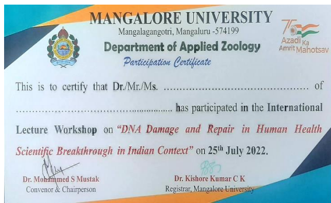
Attendance/Registration Details & Certificate