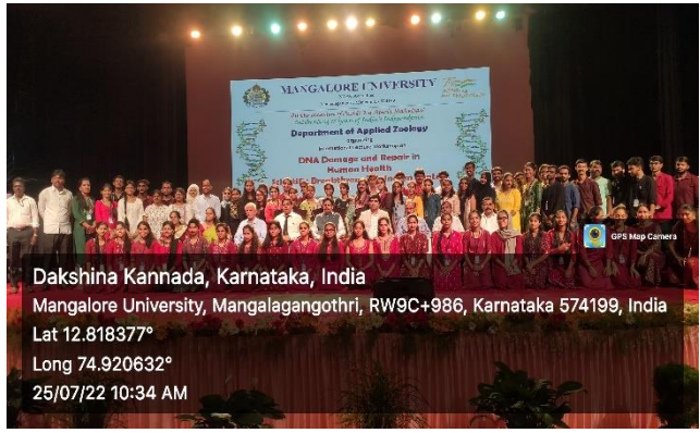
Session 03: Photo-Quiz on Biological Science