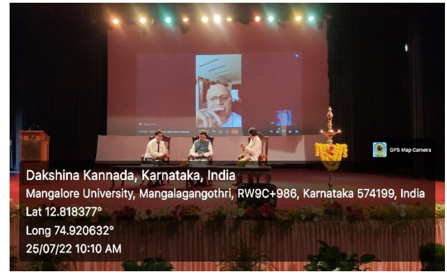
Inauguration and Keynote Address