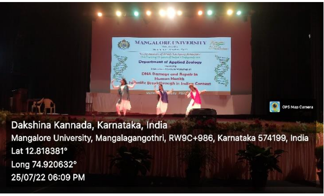
Cultural Event by M.Sc Zoology Students